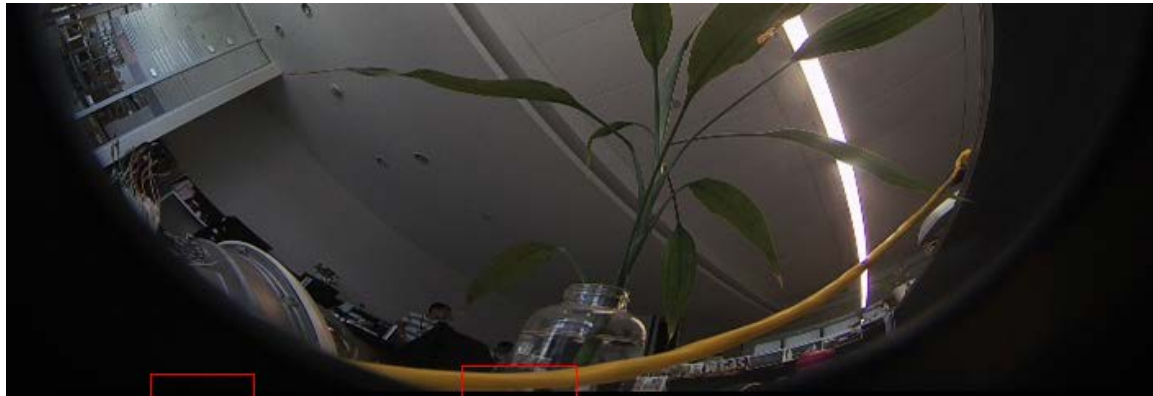
Color Schemes: High (0s) Low (0s)