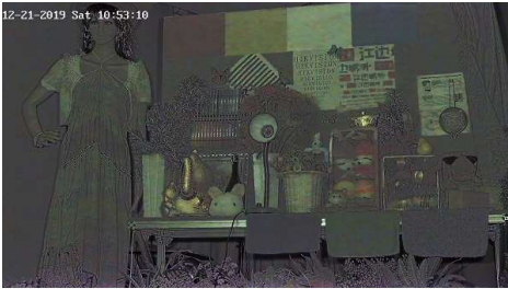
Max.Shutter Limit 1/25