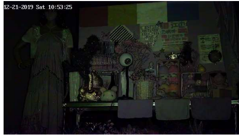
Max.Shutter Limit 1/425