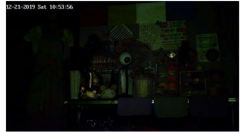
Max.Shutter Limit 1/1250